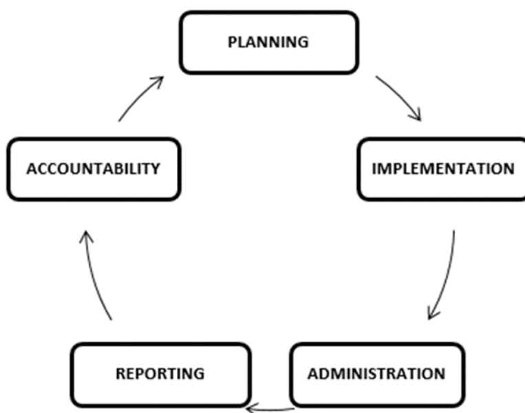
Figure 1. Village Financial Management Cycle (Village Accounting Cycle)

Implementation of the activities funded by the Village Fund is self-managed by using resources and local raw materials and labour to absorb more of the local community (Article 22, paragraph 2). Implementation of village funds needed for community participation, participation can be interpreted as take part, joint, or participate (Saragih & Court, 2017). The village fund could be used for activities that are not included in the priority use of the Village Fund after obtaining approval of regents/mayors (Article 23, paragraph 1). Approval is given in the time when the draft of village regulations regarding APBDes is evaluated (Article 23, paragraph 2). Before giving approval, regent/mayor must already ensure whether the allocation of funds for the village priority activities has been met or not (Article 23, paragraph 3).